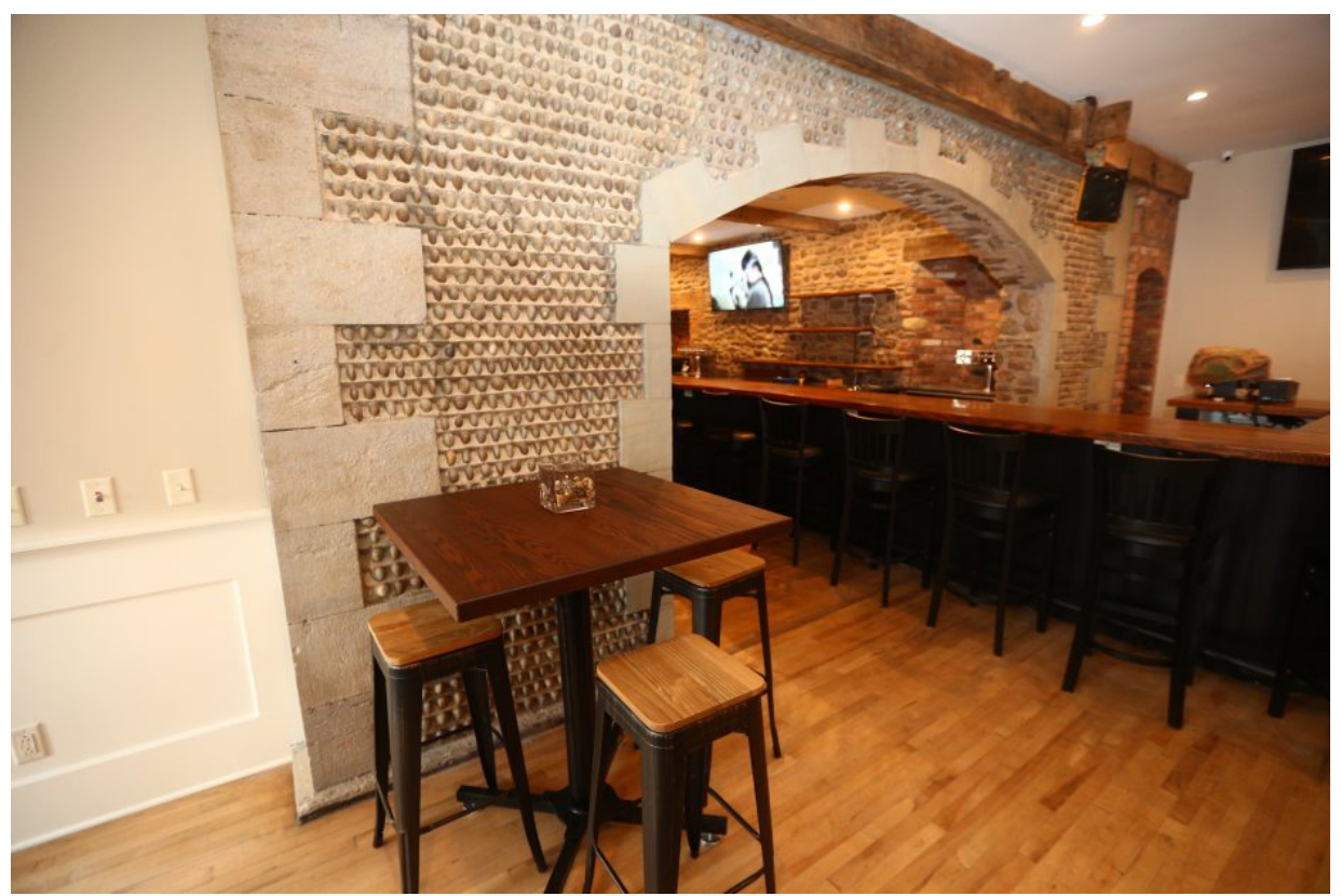
Over the bar, you can see the exposed original cobblestone wall from 1844 that has been preserved.

While the tentative opening day is April 20 for the general public, the restaurant hosted its first banquet Saturday when the Wilson Historical Society celebrated its sold-out Bicentennial Kickoff Dinner with more than 150 guests.